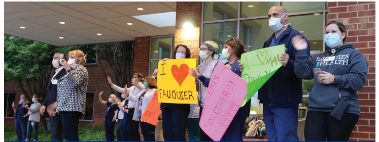
Fauquier Health hosted a Light the Night event in April 2020 to give local families a safe way to show their support for local healthcare heroes.